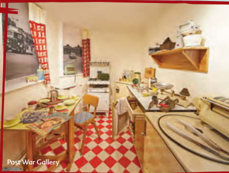
Post War Gallery

A full accessibility guide with images is available on our website www.northlincolnshiremuseum/accessibility