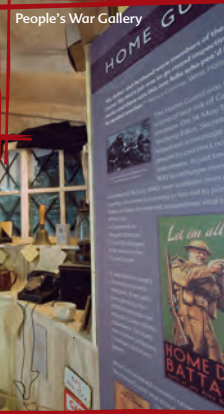
People's War Gallery