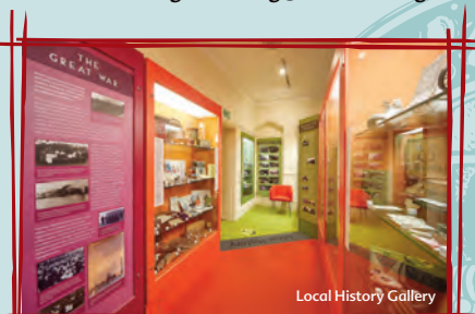
Local History Gallery

artsandheritagelearning@northlincs.gov.uk