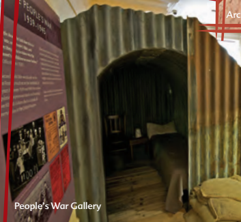
People's War Gallery