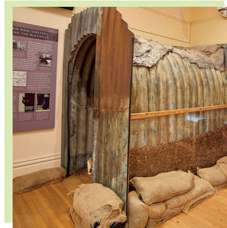
Sirens near the Anderson Shelter.