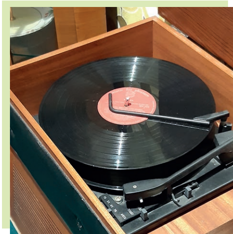
Music from the record player.