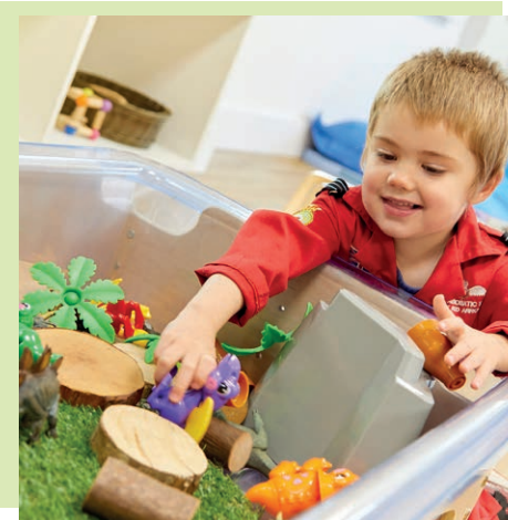
Other people enjoying the Museum.