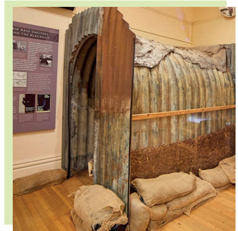
Sirens near the Anderson Shelter.