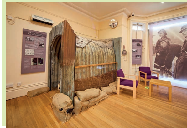
In the People's War Gallery