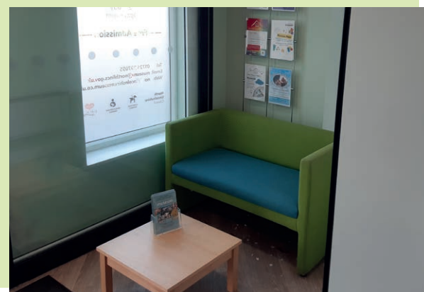
Near the Main Entrance