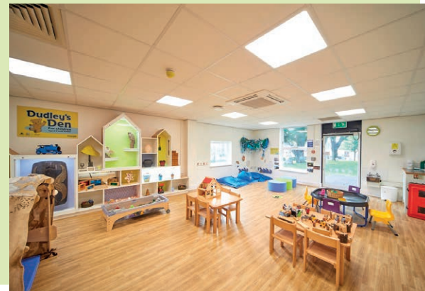
Near Dudley's Den