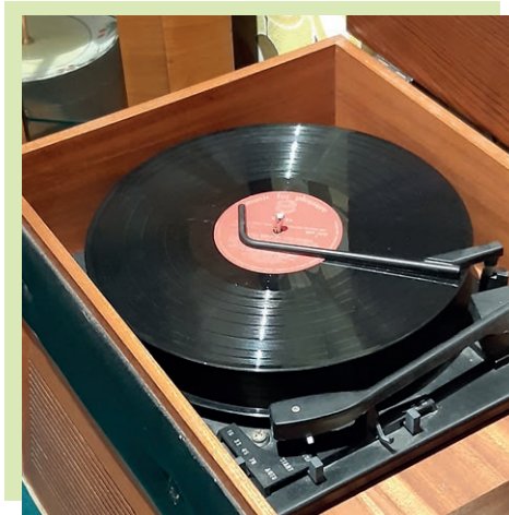
Music from the record player.