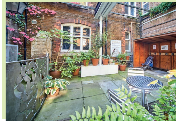
In the Courtyard